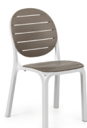
BIANCO TORTORA 40236.00.010